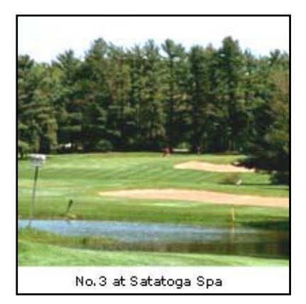
Saratoga Spa State Park 19 Roosevelt Drive Saratoga Springs, NY 12866